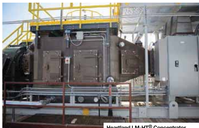
Heartland LM-HT® Concentrator

Contaminants of emerging concern: CEC, very simply, are contaminants found in drinking water and wastewater that are under consideration for regulation and for which the conventional processes used by WRRFs currently do not treat. For years, discussions about CECs revolved mostly around endocrine disruptors –