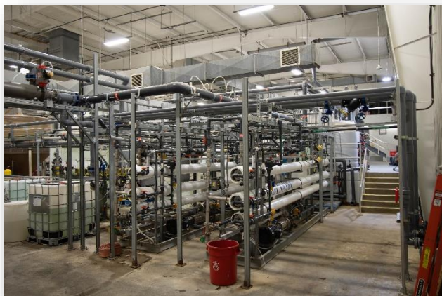
Figure 2. Concentrated Leachate from the RO Plant requires treatment