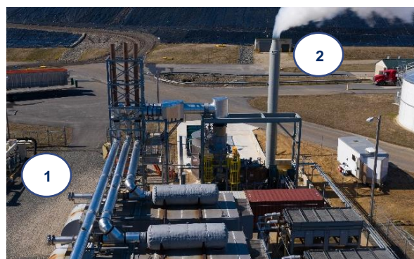
Figure 4. (1) Hot generator exhaust gas is ducted together to provide thermal energy for evaporation in the Heartland Concentrator™ (2)

For the Solid Waste Complex, The CoVAP™ solution has several important benefits. By beneficially using the engine exhaust, EPP was able to increase overall efficiency of the plant. Additionally, by beneficially reusing the exhaust and jacket water, thermal energy costs, which is often the most significant cost associated with evaporation, was removed. In the same project the Authority both saved cost and reduced the carbon footprint of the landfill.