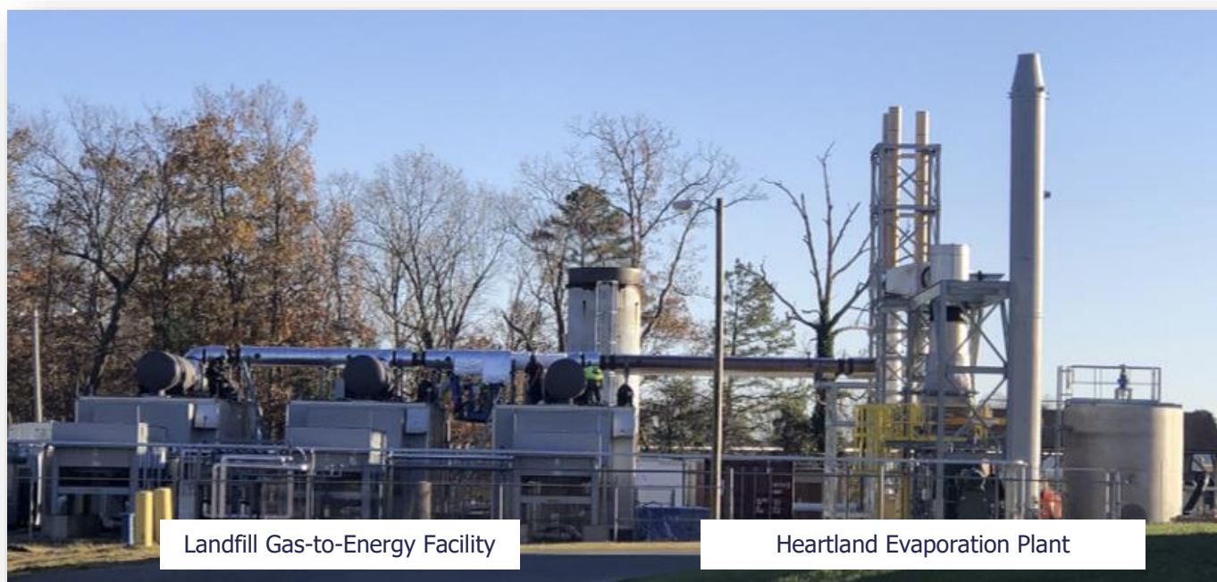
Figure 1. Profile view of the Heartland CoVAP™ Leachate Evaporation Facility

The Cumberland County Improvement Authority ("The Authority") Solid Waste Complex maximizes value of its on-site Landfill Gas-to-Energy Facility by using engine exhaust to evaporate landfill leachate reverse osmosis concentrate with Heartland's CoVAP™ Solution.